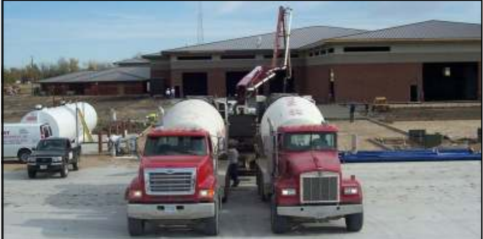
Two Ready-Mix trucks dumping into the pumper truck pouring a parking lot at the Building Department's Dawson Public Power new corporate office facility.