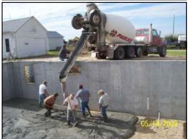
Ready-Mix: A basement pour near Norton, Kansas, out of the Arapahoe, Nebraska plant with extra trucks to help out.