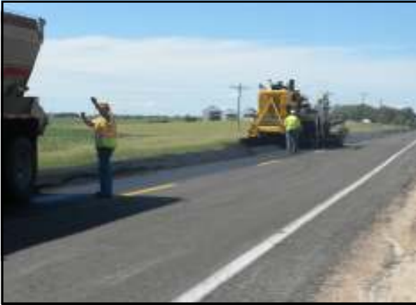
Asphalt: Wally's crew paving south of Wallace with a pickup machine feeding the paver.