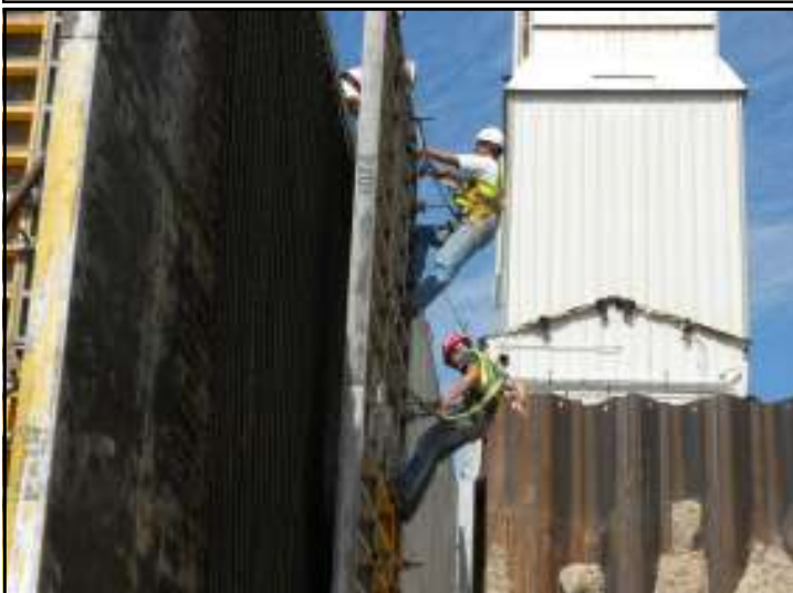
(Continued from page 1) from Hereford, Texas, who will construct a 70' tall building on top of the concrete "bunker" the crew is finishing up now. Above: Tim Dean and crew scaling three-story high forms readying for another wall pour.