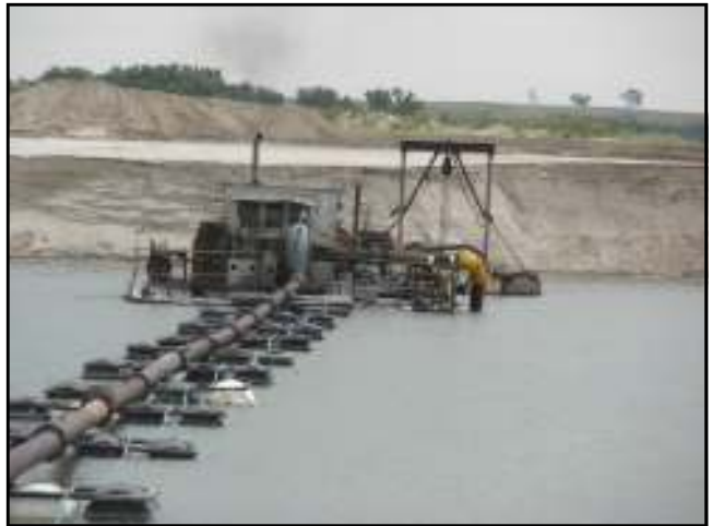
Gravel: Dredging at the Gates Pit located 17 miles north of Broken Bow.