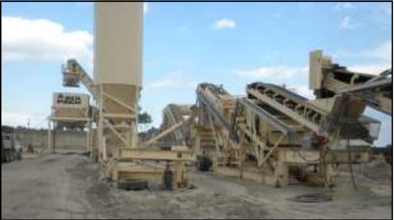
Asphalt: The Astec 300 plant located east of Broken Bow for AI's Highway 70 paving project.