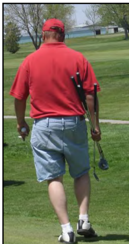
If you can't decide which club to use, just take them all.