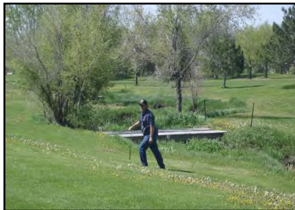
The flag prize was for closest to the ditch WITHOUT going in — darn!