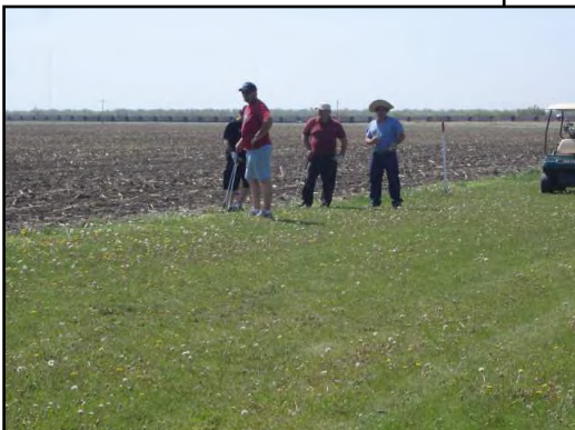
Are you sure the fairway is this way?